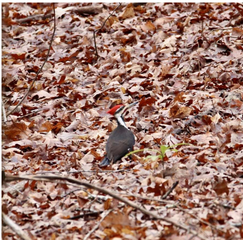
Pileated Woodpecker, Male