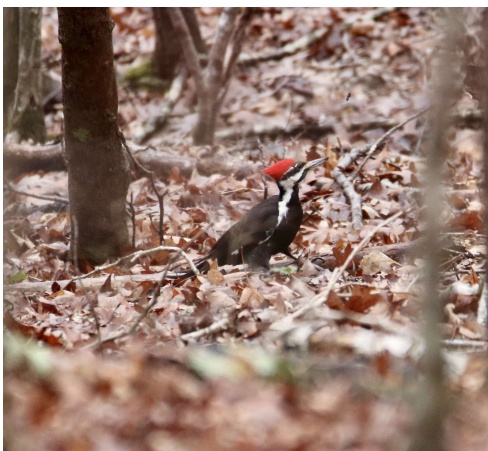
Pileated Woodpecker, Female