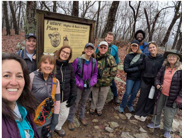
Our Group Selfie