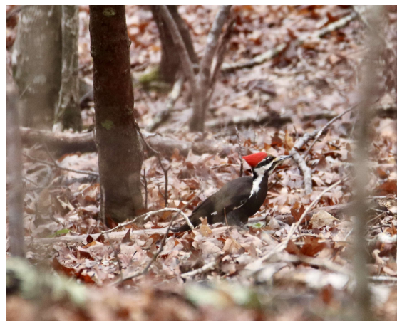
Pileated Woodpecker, Female