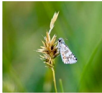
White Checkered Skipper