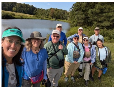
Birding Group