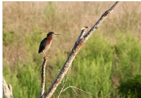
Green Heron