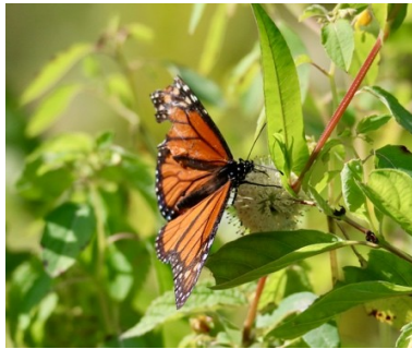
Monarch Butterfly on a Button Bush