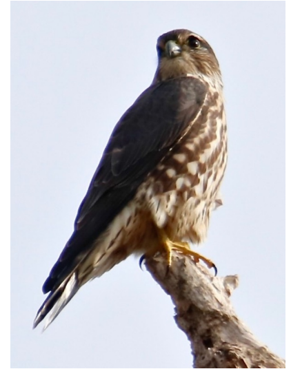
Merlin

Carolina Wren Eastern Bluebird American Robin Dark-eyed Junco White-throated Sparrow Song Sparrow Common Grackle Northern Cardinal