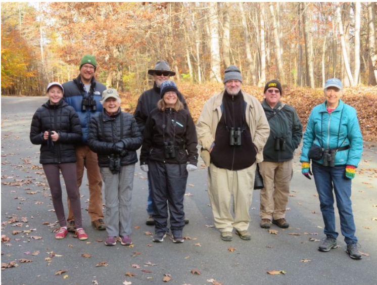
PYB at Haw River State Park