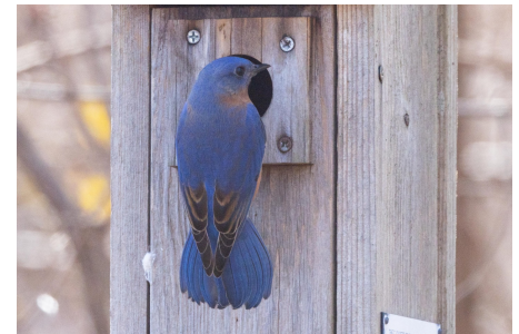
Male Eastern Bluebird