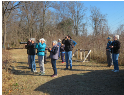
Group photo