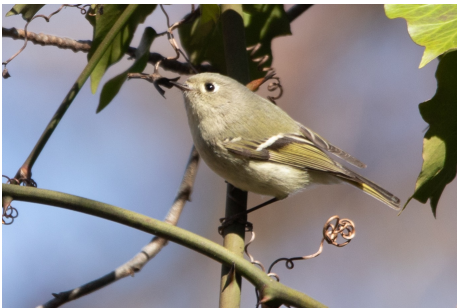
Ruby-crowned Kinglet