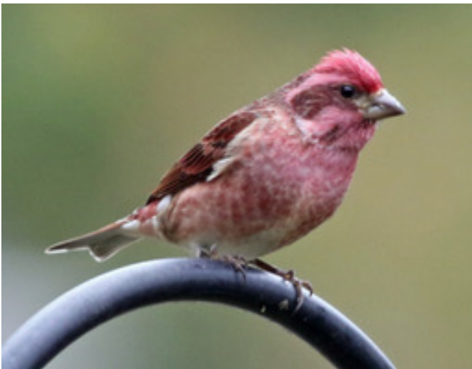
Purple Finch by Lou Skrabec