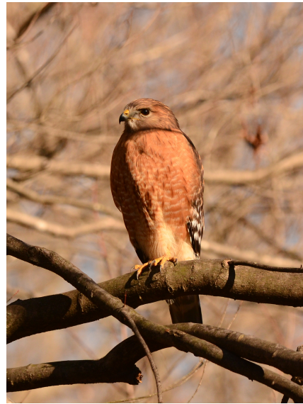
Red-shouldered Hawk