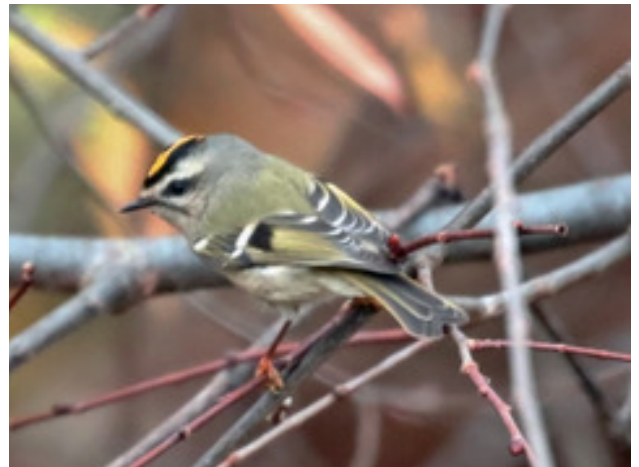
Golden-crowned Kinglet by Lou Skrabec