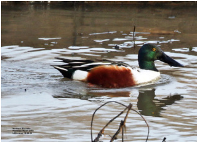
Northern Shoveler by Lou Skrabec