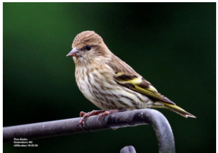
Pine Siskin by Lou Skrabec