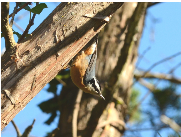
Red-breasted Nuthatch by Matt Wangerin

Our sparrow numbers for all species were well below our average, as were numbers for Dark-eyed Junco. While we've been having a big outbreak year for Pine Siskin and Purple Finch, our numbers for the count were in double digits, well below the 338 Siskins and 476 Finches that were our previous high numbers. Those high numbers occurred in the mid-1970s. Purple Finch has showed up on our count 43 times since 1972, while Pine Siskin has showed up 26 times in that time.