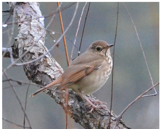
Hermit Thrush by Matt Wangerin