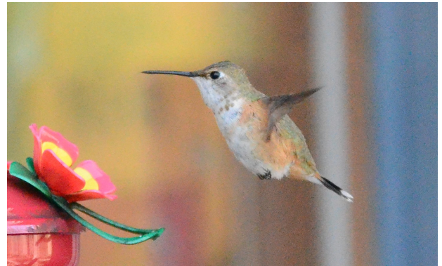
Rufous Hummingbird

Unusual sightings for the count were a Rufous Hummingbird, which we've had only on 4 other counts; an Orange-crowned Warbler, which we've had on 5 other occasions; and Baltimore Oriole, which, while they have been pretty consistent the last few years, have only appeared on 12 other counts.