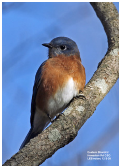
Eastern Bluebird by Lou Skrabec