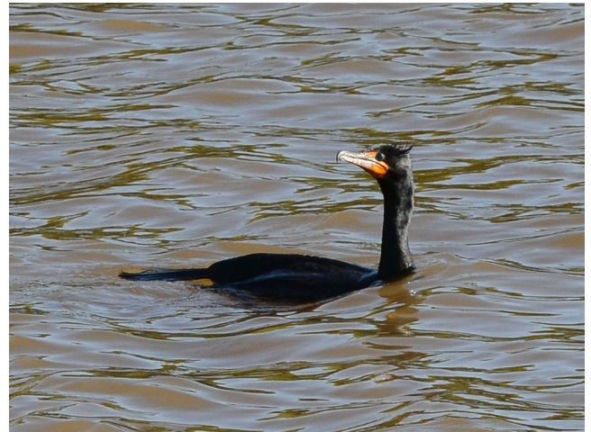
Double-crested Cormorant by Matt Wangerin