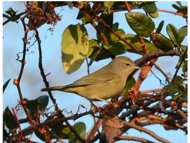
Orange-crowned Warbler by Matt Wangerin