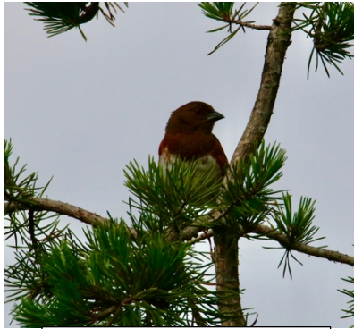
Eastern Towhee, female