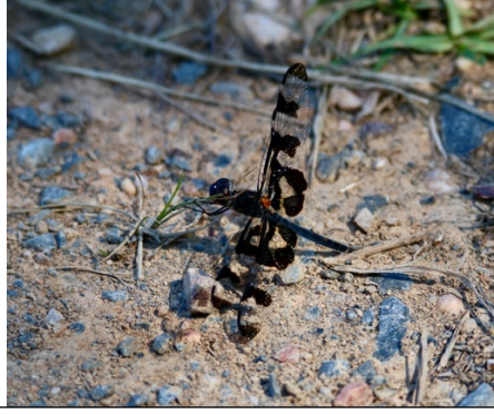
I think these are a Banded Pennants