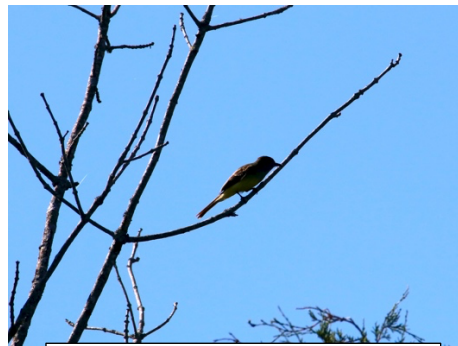
Great Crested Flycatcher