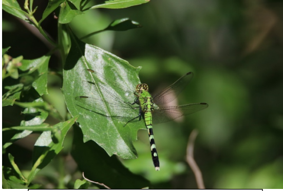
Eastern Pondhawk, female, the males are blue