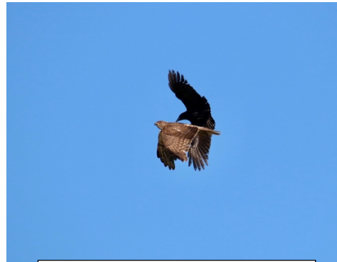
Red-tailed Hawk, being mobbed by an American Crow