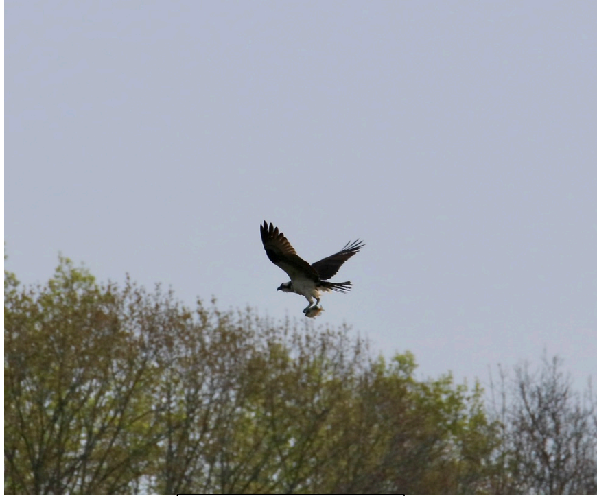
Osprey, off whit its meal