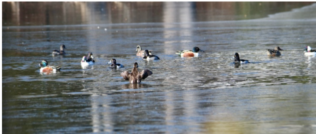
American Wigeon, Ring-necked Ducks, Northern Shovelers, And Bufflehead