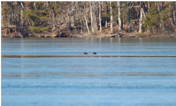
American Black Ducks