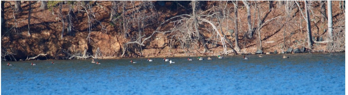
Redheads x 10, Mallards, and a Ring-billed Gulls