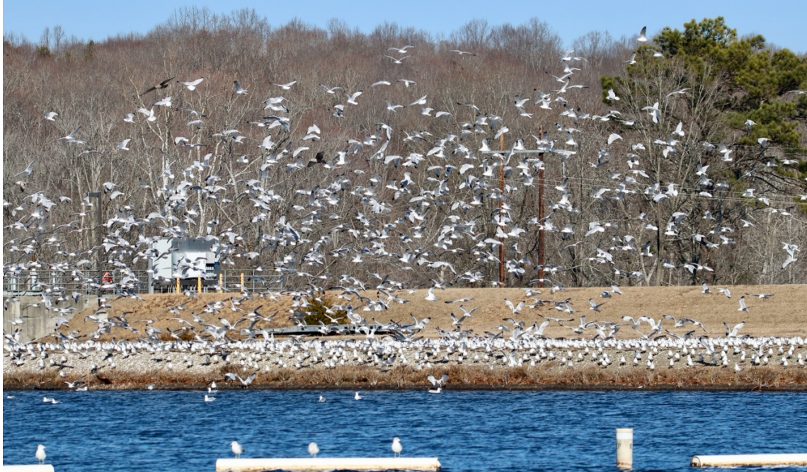
A flock of Ring-billed Gulls, look closely to see the 2 American Herring Gulls (darker)