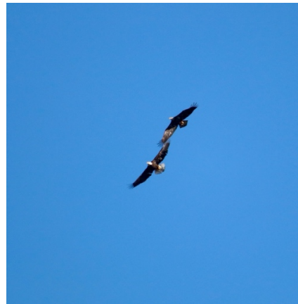
A pair of Bald eagles