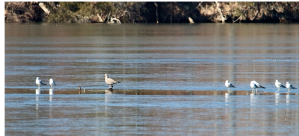
American Herring Gull, Ring-billed Gulls, and Pied Billed Grebes