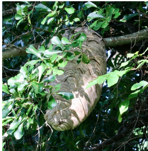
Large Hornet's nest, note Hornet at the bottom