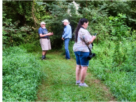
Birders, photo by Lynn Allison