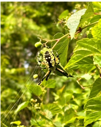
One of several Black & Yellow Spiders we saw