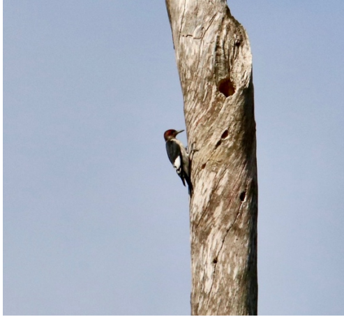
Red-headed Woodpecker, juvenile