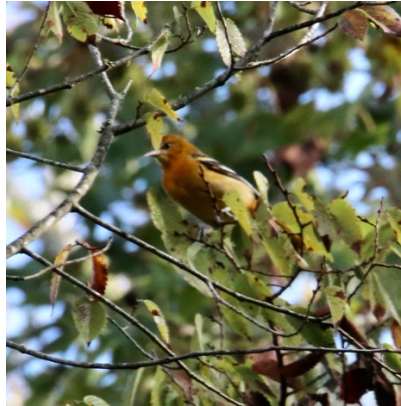
Baltimore Oriole, female