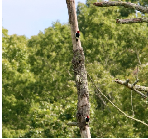
Red-Headed Woodpeckers (2)