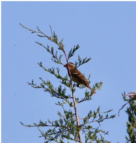
Rose-breasted Grosbeak, female