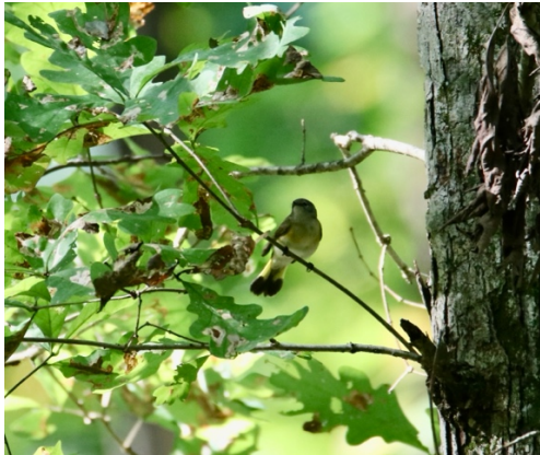
American Redstart, female