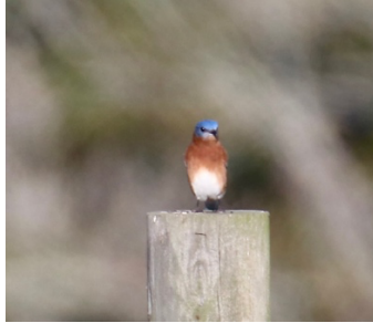
Eastern Blue Bird