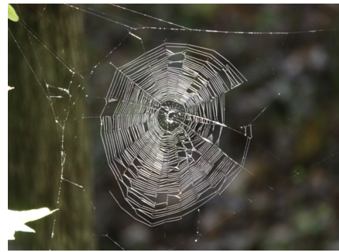
An awesome web