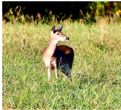
An observer, watching the Bird Watchers