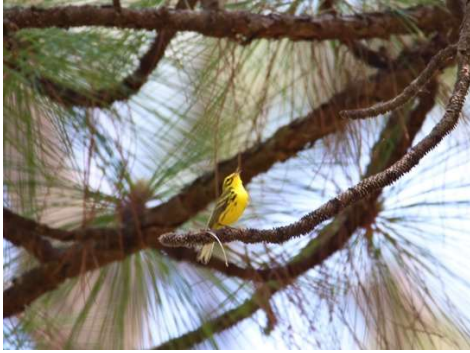
Prairie Warbler, singing