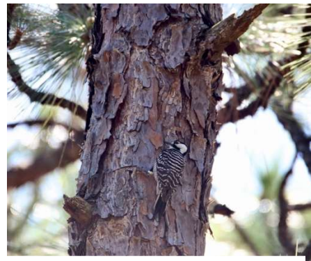
Red-cockaded Woodpecker with silver and yellow leg bands