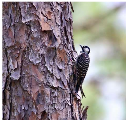
Red-cockaded Woodpecker with purple and white leg bands