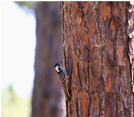
Red-cockaded Woodpecker with white and green leg bands