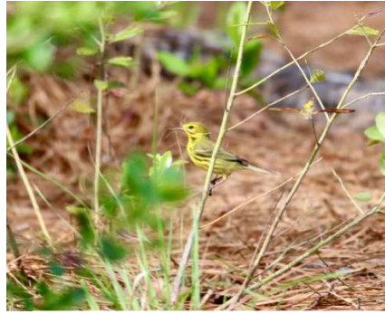
Prairie Warbler, with nesting material