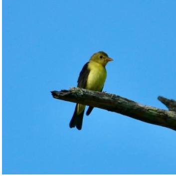
Scarlet Tanager, female