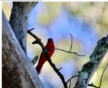
Scarlet Tanager, male