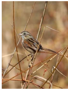
One of several Swamp Sparrows