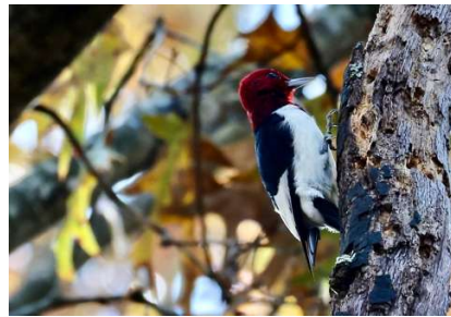
Red-headed Woodpecker, by Ashley Barret