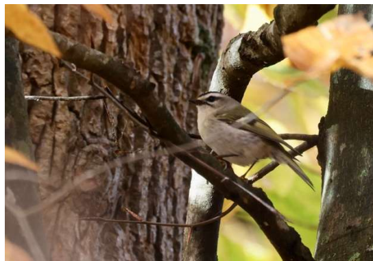
Golden Crowned Kinglet