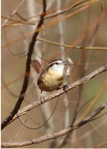
Carolina Wren with worm