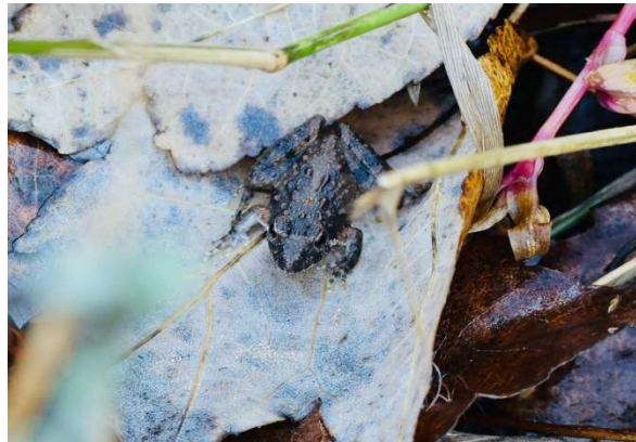
Southern Cricket Frog