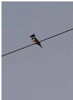
Belted Kingfisher