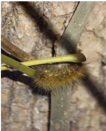
Virginian Tiger Moth Caterpillar