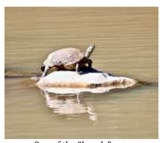
One of the "Locals"