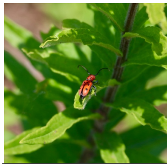
Milkweed Longhorn Beetle