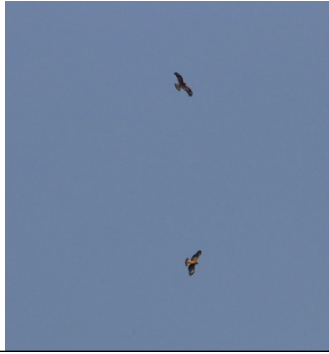
Red-shouldered Hawks x2