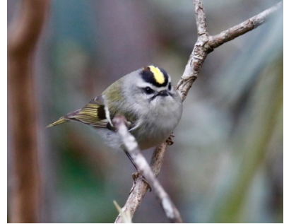
Golden-crowned Kinglet