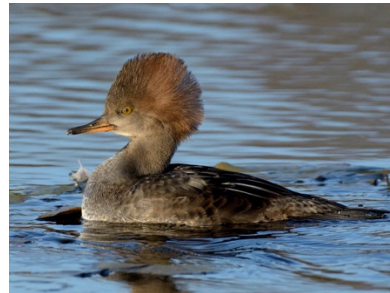
Hooded Merganser, female