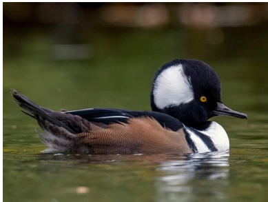
Hooded Merganser, male