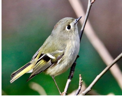
Ruby-crowned Kinglet