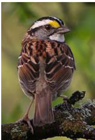
White-throated Sparrow

It was a beautiful fall day for our field trip. Our group welcomed some veteran members as well as a few brand new ones. As we wandered along the boardwalk a substantial flock of American Robins livened the tree tops and White-throated