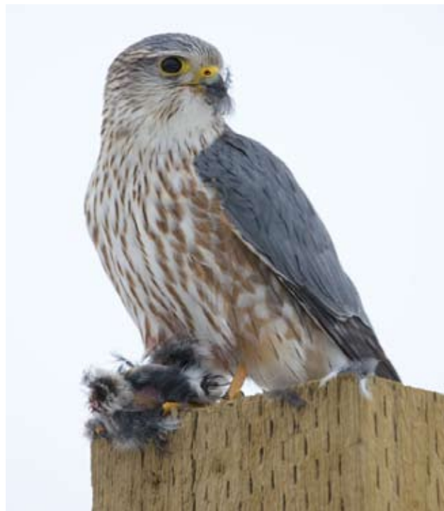
Merlin, Falco columbaris - Photo by Raj Boora

Also of note was one enormous mixed flock (i.e., 500 -1,000) of blackbirds. In spite of careful searching we were unable to find any but the usual suspects.