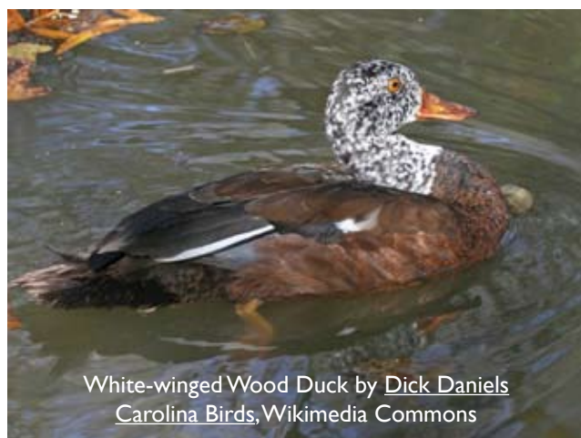
White-winged Wood Duck

at Sylvan Heights Waterfowl Breeding Center represent the best hope of survival for many of the world's rarest and most critically endangered waterfowl species. The staff also work with conservation partners in Cambodia, Venezuela, Brazil, and other countries in order to promote conservation efforts in the native habitats of threatened species.