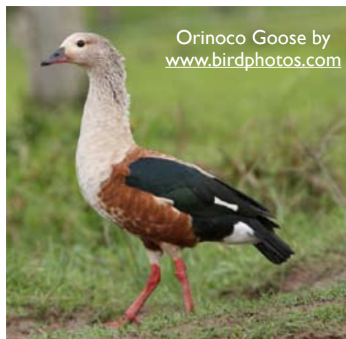
Orinoco Goose

Adjacent to the Waterfowl Park is the 8-acre Sylvan Heights Waterfowl Breeding Center, home to over 170 species of birds, including half the known species of ducks, geese, and swans. Survival of the world's waterfowl is highly dependent on this avian breeding preserve, which cares for more than 2500 individual birds, including over 1000 hatchlings reared each year. The breeding projects initiated