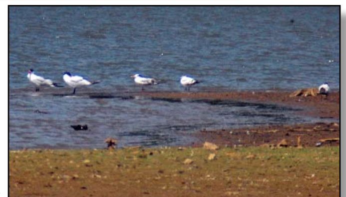
Royal Terns & Caspian Terns