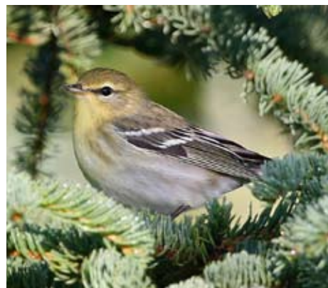
Blackpoll Warbler, non-breeding plumage

from Greensboro. Those near the top of the table fly relatively short distances. Those closer to the bottom are long-distance champions, especially when one considers that some of these birds start their travel as far north as Canada!