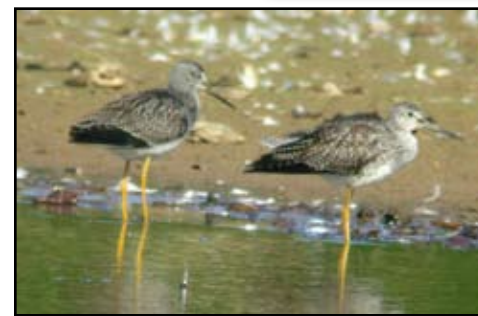
Lesser Yellowlegs by Lou Skrabec