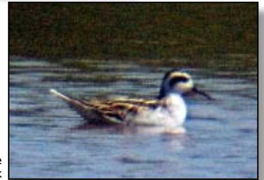
Red-necked Phalarope by Henry Link