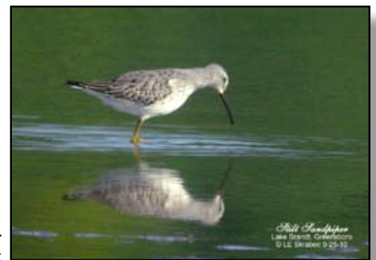
Stilt Sandpiper by Lou Skrabec