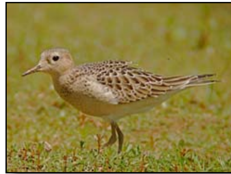
Buff-Breasted Sandpiper