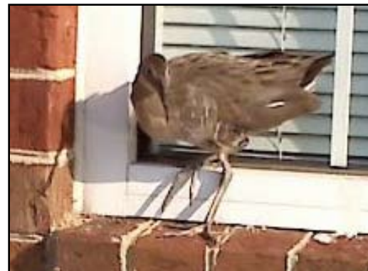
Clapper Rail fide Hop Hopkins