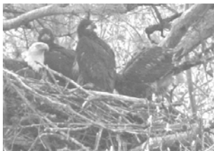
Bald Eagles on Lake Brandt