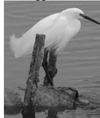
Snowy Egret at HBSP

The majority saw at least one life bird on the trip. Some of the most notable birds seen or heard were Swallow-tailed Kites, Least Bittern, American Bittern, Bald Eagles, Cave Swallows (hanging out in the gazebo on the causeway at HBSP), Common Eider, Common Loon, Wilson's and Piping Plovers, Black-necked Stilts, Pectoral Sandpiper, Red-cockaded Woodpeckers, Whip-poor-will and Chuck-will's-widow, Black Skimmers, Swamp Sparrows, American Oystercatchers, Whimbrel, Marsh Wrens, Orchard Oriole, Painted Bunting, Sandwich Tern, Prothonotary Warbler, Yellow-throated Vireo and Warbler. And the list goes on. Birds we expected to see and didn't include the Purple Sandpiper and Loggerhead Shrike.