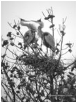
Great Blue Herons on Valentine's Day