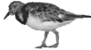
Ruddy Turnstone